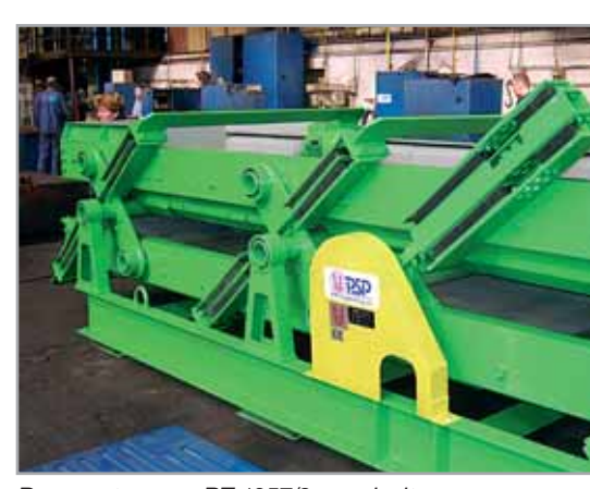
Resonant screen RT 1357/2 – andesite screening

Stated capacities are only informative and depend on the properties and composition of the material and mesh size.