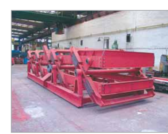
Resonant screen RT 2087/2 – in the manufacturing plant