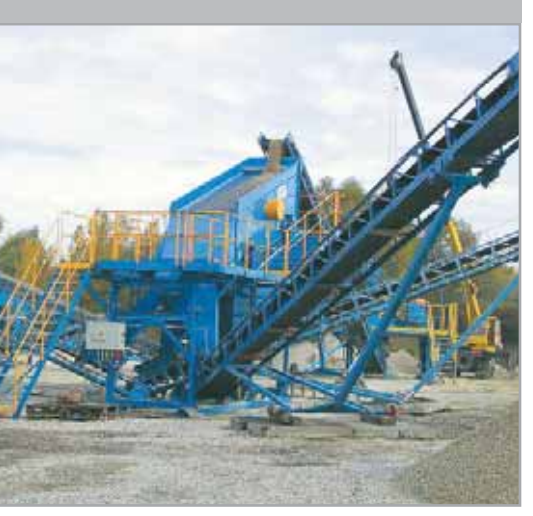
Vibrating screen KDT 1650/3 – gravel sand screening