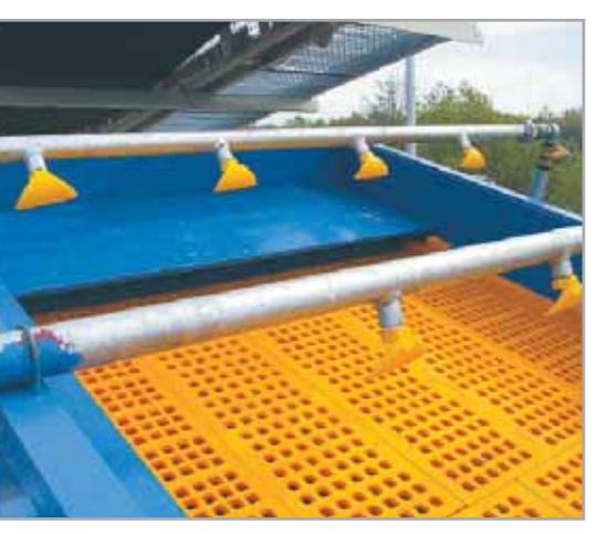
Vibrating screen KDT 1650/3 – deck with PU screens

Vibrating screens KDT are used for screening of non-sticking grained materials in wet and dry technology. They are excellent for final screening of materials with unfavorable shape values with a tendency to clog. In some cases the KDT screens are preferred for their lower weight and smaller dimensions over larger heavy resonant screens RT. They achieve higher outputs and allow sorting to more fractions. Vibrating screens KDT are used for screening of inlet grains to 3 – 5 fractions. The screening unit on skids can be placed on a concrete base, panels or stiffened bed with an appropriate loading capacity. The unit does not have to be anchored.