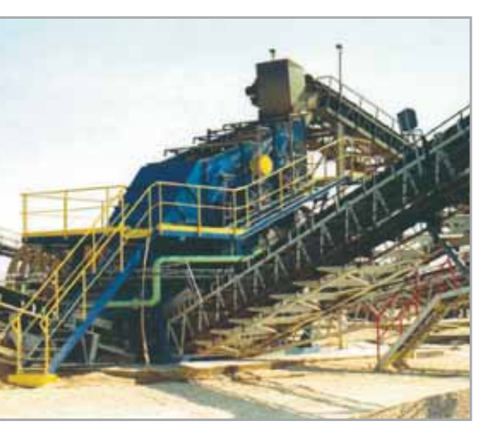
Vibrating screen KDT 2050/3 – gravel sand screening