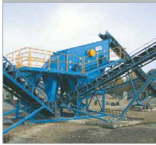
Vibrating screen KDT 2050/2 – granite screening