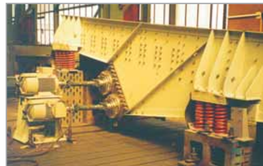
Feeder PVR 1550 x 6000 in the test room in the manufacturing plant