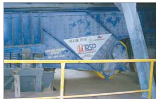
Feeder PVR 1550x6000