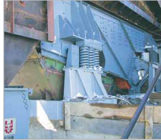
Feeder PVR 1200x6000