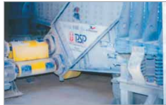
Feeder PVR 1550x6000