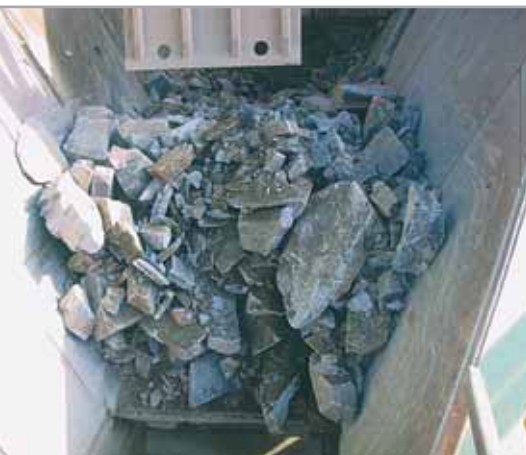
Feeding of quarry stone by the trough feeder ZP 1000x5000