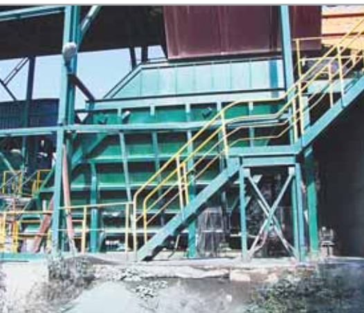
Trough feeder ZP 1000x5000

Trough feeders are used for feeding lumpy and grained materials. They are used in material treatment plants for feeding from primary