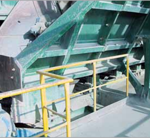
Trough feeder ZP 1000x5000